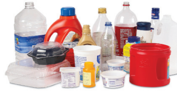
Empty Plastic Bottles, Rigid Plastic Containers, Plastic To-Go Containers (#6 not accepted)