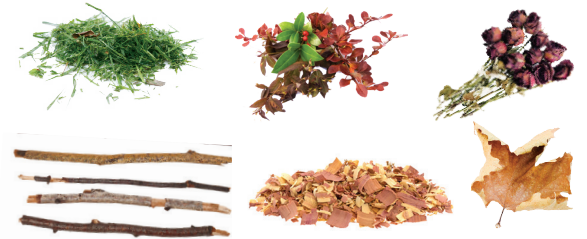
Grass, Weeds, Green Plants, Tree Limbs, Wood Chips, Dead Plants, Brush, Garden Trimmings, Leaves, Cut Flowers

Used oil is accepted at all local HHW drop-off facilities: https://wmr.sacounty.gov/Pages/HHW-Dropoff-Centers.aspx