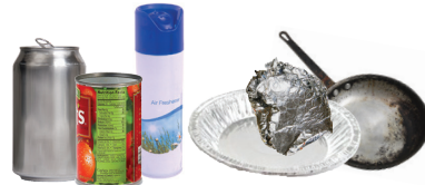
All Metal Beverage & Food Cans, Empty Aerosol Cans, Clean Aluminum Pans & Foil, Small Scrap Metal (Up To 20 Pounds)