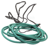
Hoses, Cords & Wire