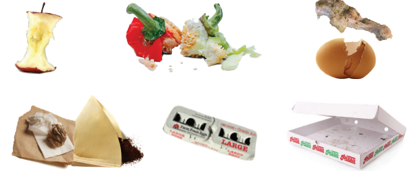
Food Scraps, Including Egg Shells, Meat & Bones, Pizza Boxes, Cardboard Egg Cartons & Food-Soiled Paper, Coffee Grounds

Please use paper or ASTM D6400 rated compostable bags only to collect organics.