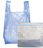
Plastic Wrap, Bags & Other Plastic Film