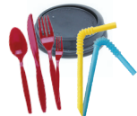
Cup Lids, Plastic Utensils, Plastic Straws (Including Compostable)