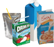
Beverage Pouches & Aspic & Gable-Top Cartons