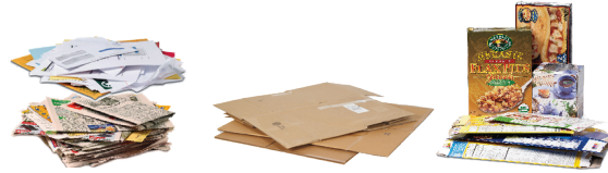
Clean Paper, Magazines, Newspaper, Junk Mail, Cardboard, Cardboard Egg Cartons, Cereal Boxes

Please do not bag recyclables, keep loose. Please empty all containers prior to recycling.