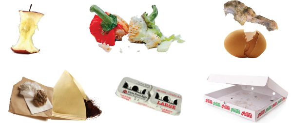
Food Scraps, Including Egg Shells, Meat & Bones, Pizza Boxes, Cardboard Egg Cartons & Food-Soiled Paper, Coffee Grounds

Please use paper or ASTM D6400 rated compostable bags only to collect organics.