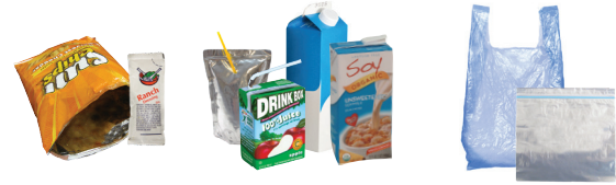
Snack & Chip Bags, Candy Wrappers & Condiment Packages

Please keep recyclables and organic material out of the trash.