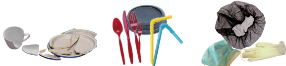
Broken Glass & Dishes (Please Wrap)