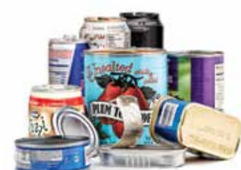
Food & Beverage Cans Tin, aluminum, steel food & beverage cans