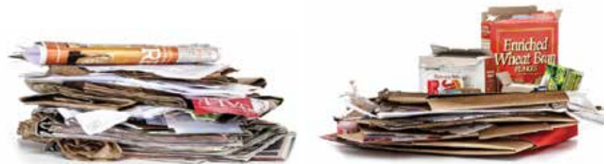
Paper, Flattened Cardboard & Paperboard Flatten all boxes (do not bundle/tie up) No shredded paper.