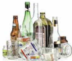
Glass Bottles, jars