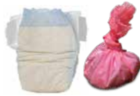
Diapers & Pet Waste