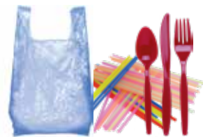
Plastic Bags, Straws & Utensils

Unsure if an item is recyclable? When in doubt, leave it out of recycling.