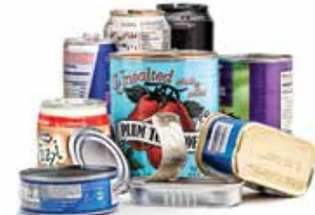
Food & Beverage Cans Tin, aluminum, steel food & beverage cans