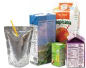
Juice Pouches/Boxes, Cartons (with plastic tops)

Do not place Household Hazardous Waste or electronic waste in the trash cart. For proper handling, please see the Household Hazardous Waste panel.