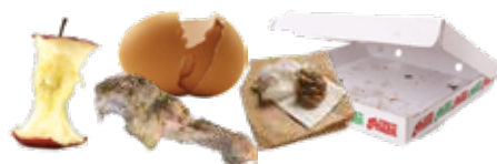
Food Waste & Food Soiled Paper