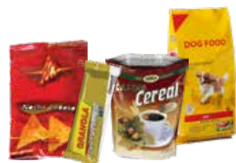
Food Wrappers, Pet food Bags