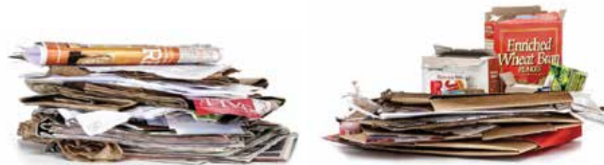
Paper, Flattened Cardboard & Paperboard Flatten all boxes (do not bundle/tie up) No shredded paper.