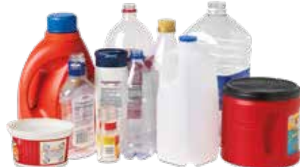
Plastic Bottles & Containers Bottles, jars, jugs & tubs